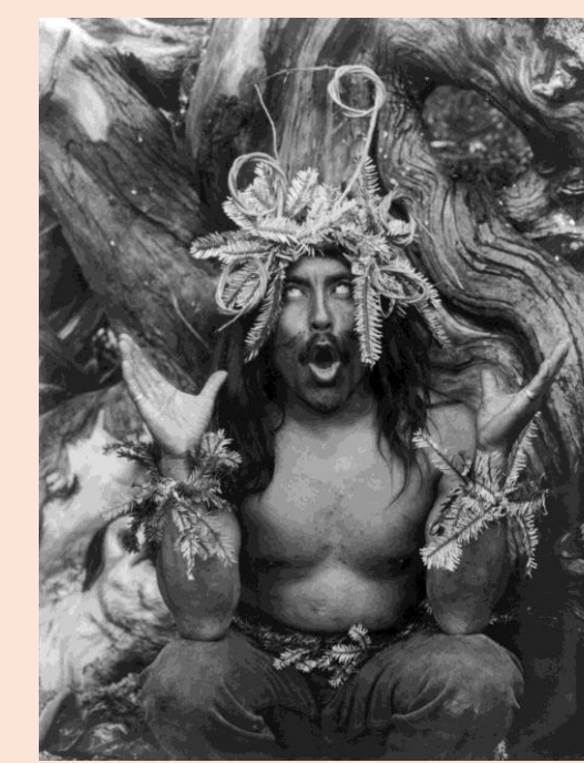
© Curtis, Edward S. The North American Indian: the complete portfolios . 1997. Reprint, Köln: Taschen, 2003.