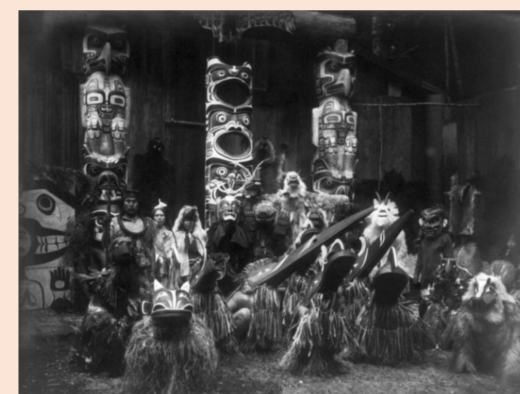
© Curtis, Edward S. The North American Indian: the complete portfolios . 1997. Reprint, Köln: Taschen, 2003.