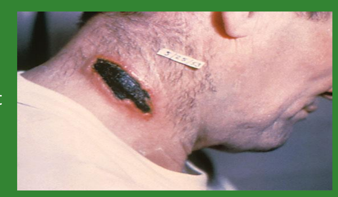
> 95% of human cases are cutaneous. Patients develop painful lesions (eschars) which are generally found on exposed regions of the body. Treatable with antibiotics if diagnosed early.