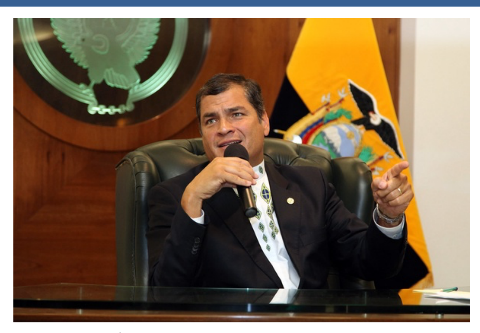
Figure 1. Check References