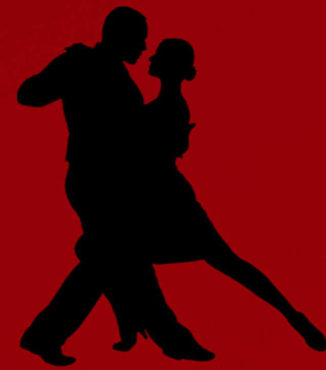
Stages de Tango (2013)