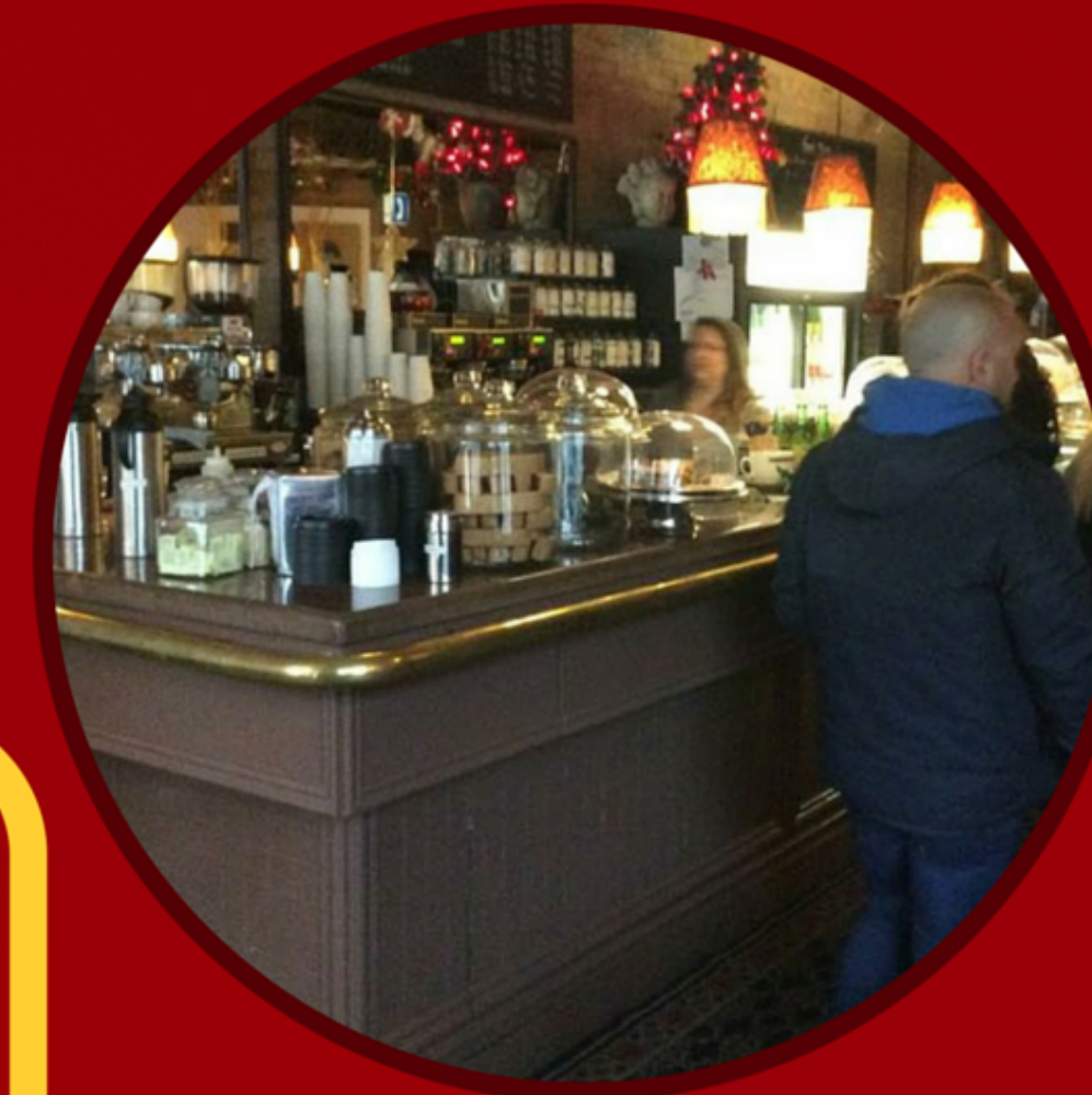
Looking onto the high counter