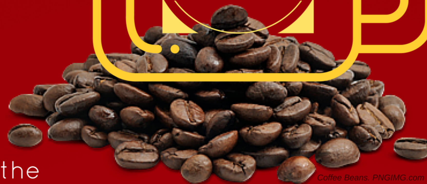
Coffee Beans.