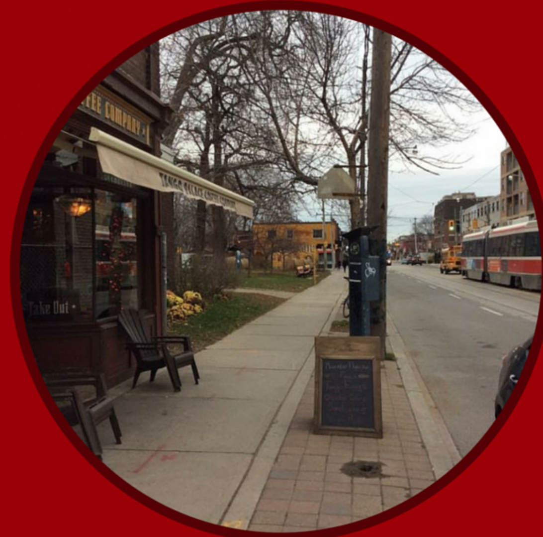
The view from outside the space – looking east