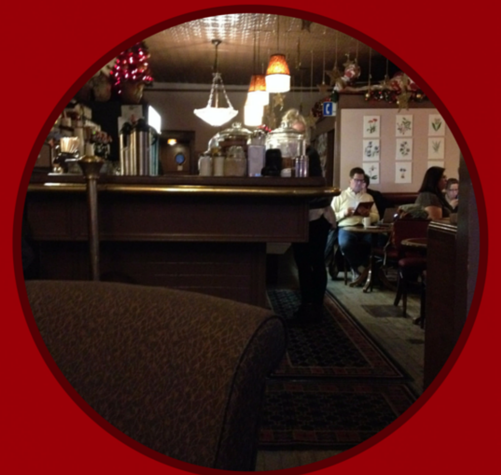
View into café from SW window