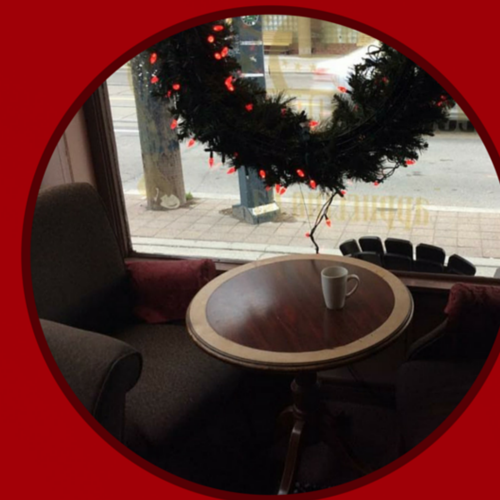
Southwest window seat