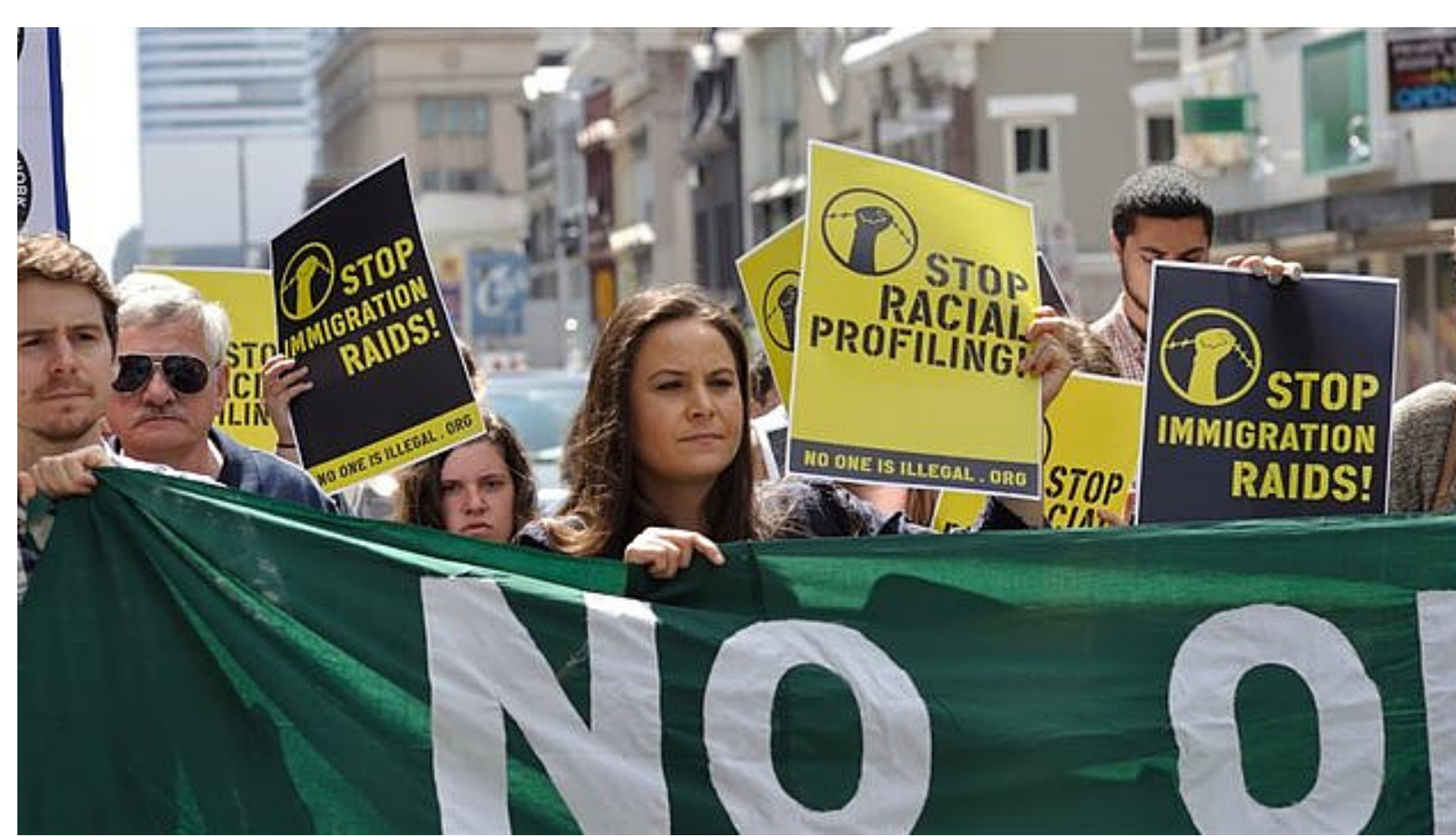
NOII-Toronto protests in August 2014.

Below: In 2014, NOII-Toronto protested in response to the round-up of 21 undocumented workers in an early morning traffic check. In the same year, NOII-Vancouver successfully changed transit policy in a similar incident.