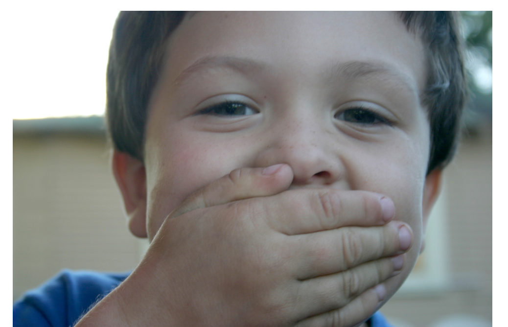
Above: In 2006, TDSB passed "Don't Ask, Don't Tell" policy because of NOII's lobbying efforts

Public transit should not be a border checkpoint!