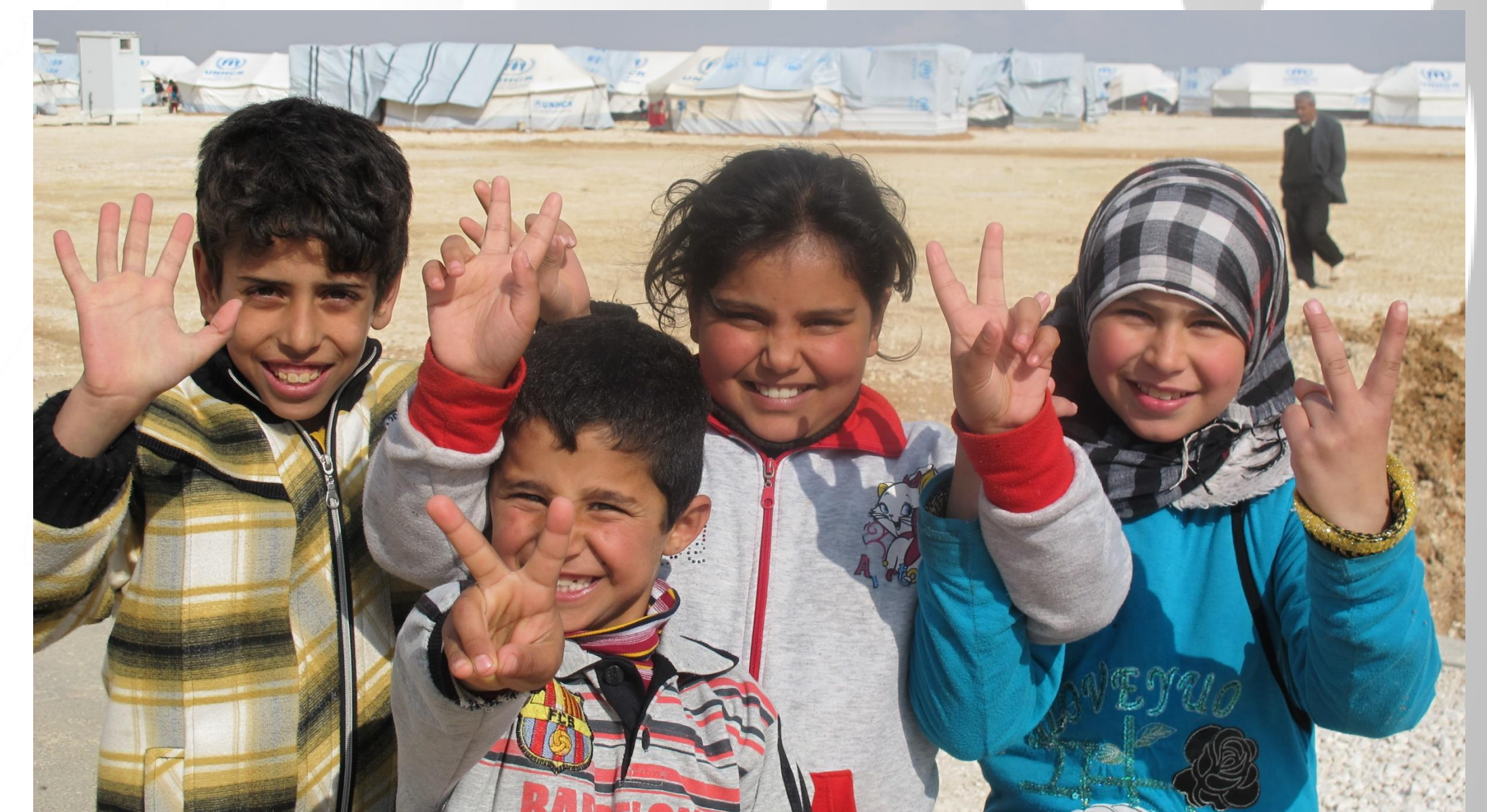
Four youth living in refugee camps showing 'peace' signs with their fingers*