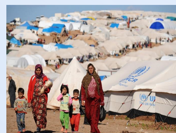
NGO facilitated refugee camp*

-Rules, regulations and policies put in place at refugee camps run by the UNRWA throughout the Middle East restrict and heavily impact the lives of youth living there.