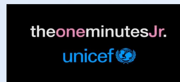
Media program run by NGO*

-provide access to youth media programs (like oneminutejrs.) in the hopes of compelling youth living in refugee camps to feel strongly about bettering their current situation that was essentially started by NGOs.