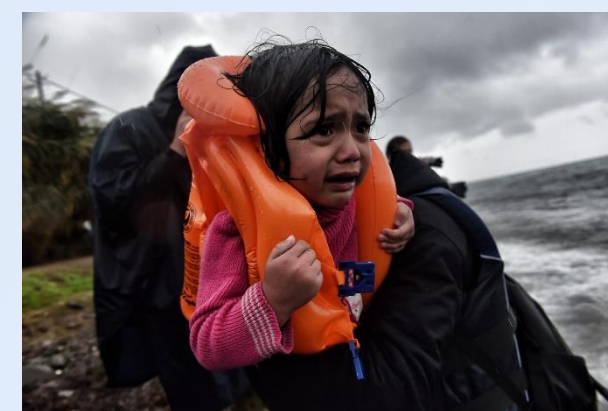
Distressed refugee child*

-traumatized youth are understood as potential terrorists, and must be given an outlet to prevent a possible violent outburst.