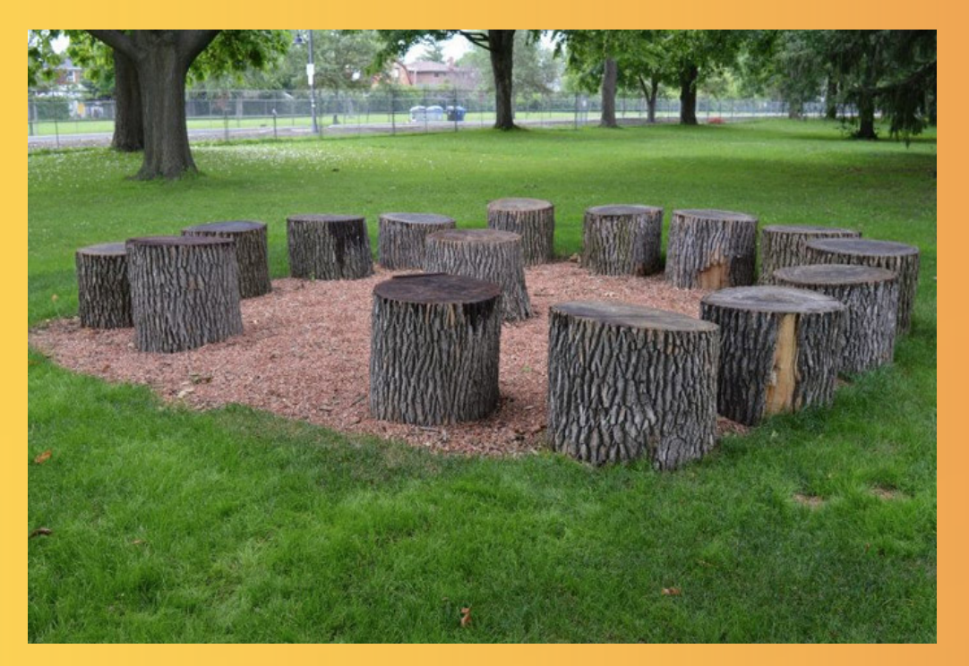
Healing Circle at the Gatehouse, Toronto, ON http://thegatehouse.org/

Organizations that use restorative justice techniques such as healing circles and place emphasis on community healing have been shown to effectively deal with the rates of sexual abuse and childhood sexual abuse. Where facilities able to work within the context of Indigenous values and the Declaration exist, rates have dropped drastically.<sup>4</sup> We must offer a "future where those impacted by childhood sexual abuse can heal and reclaim their voices".<sup>5</sup>