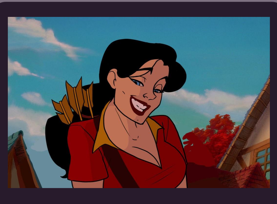
FEMALE GASTON Beauty and the Beast